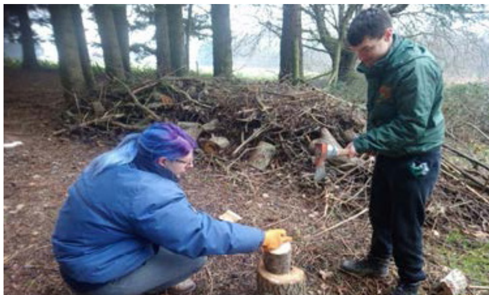
Learning Support Assistants support in practical lessons